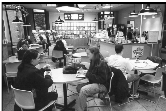
Students enjoy the ambiance of the Books and Bytes Café at the Milne Library.

Send us photographs of your latest campus triumphs, facilities renewal, innovative projects, and successes and we'll include them here.