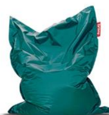
Fat Boy beanbag chair

Small grants continue to power the library to serve student needs. This year we will be spending $5,000 to buy current textbooks, and we have five new Fat Boy beanbag chairs, both courtesy of a Program Account grant from SUNY Poly Auxiliary Services. Thank you!