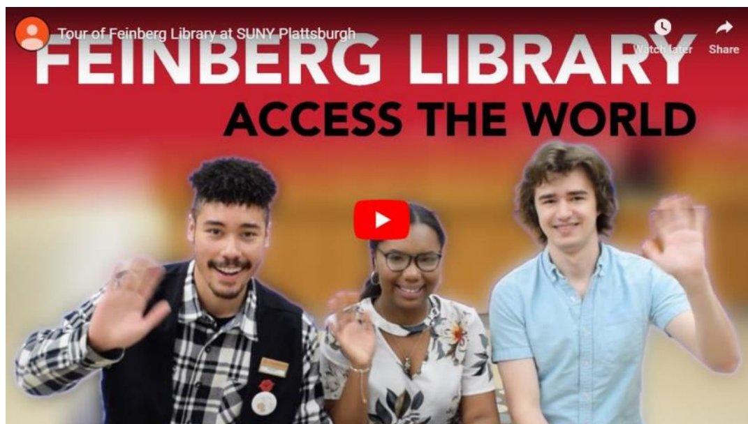
Image from video tour, SUNY Plattsburgh Library