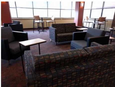
Reading room furniture, SUNY Morrisville Library