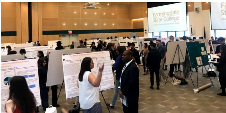
SURC Poster Session, SUNY Farmingdale