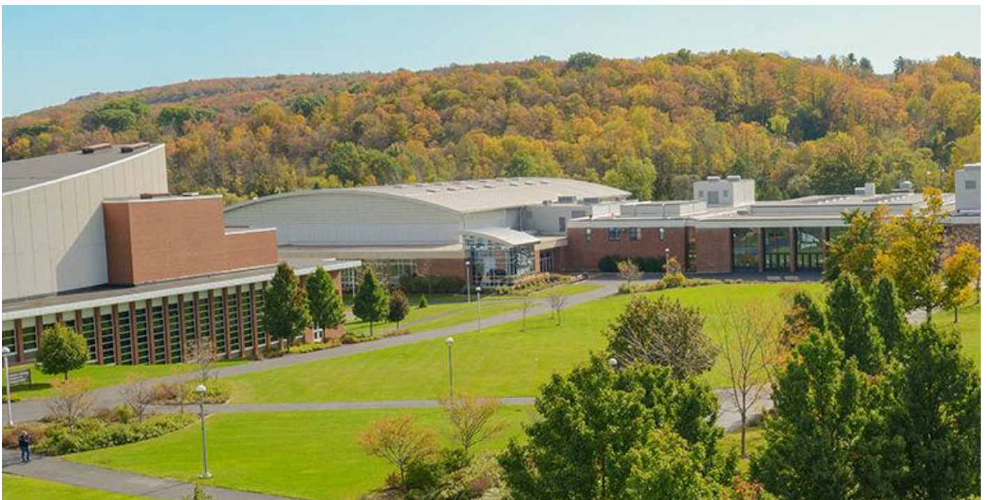
MVCC, Utica Campus

Any questions about the conference can be directed to Jocelyn Ireland at jireland@mvcc.edu . Start brainstorming breakout session or poster proposal ideas now—the initial call for proposals can be expected sometime in December.